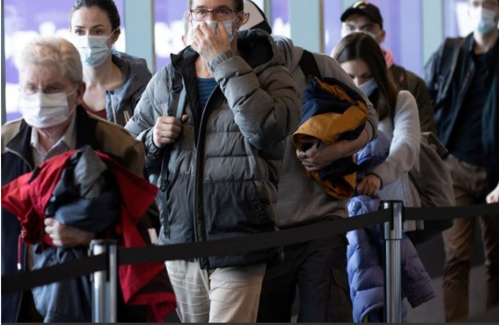
Passengers need to eat and drink on a long-haul flight, which means they remove their masks and risk spreading or catching Covid-19.