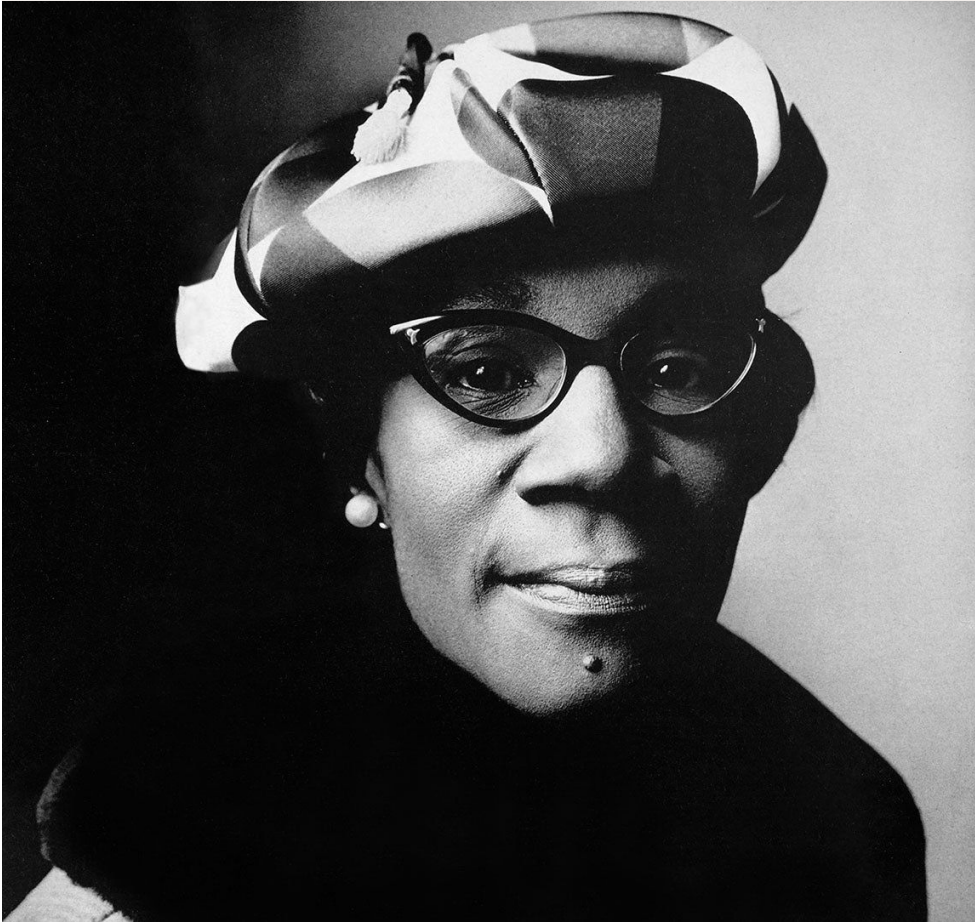
Shirley Chisholm Photographed by Irving Penn, Vogue, May 1, 1969